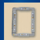
5" x 7" MAGNETIC FRAME SAMF180