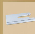
WIDE TABLE SAWTNQ1C