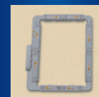
7" x 12" MAGNETIC FRAME SAMF300