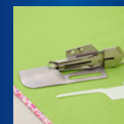
DUAL FUNCTION FOLD BINDER SA231CV