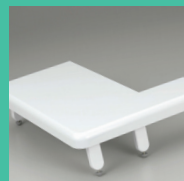
WIDE TABLE SAW T8