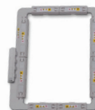
7" x 12" MAGNETIC FRAME SAMF300