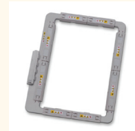
7" x 12" MAGNETIC FRAME SAMF300