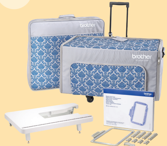
WIDE TABLE SAWTXP1C