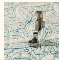
HIGH SHANK RULER FOOT SA218