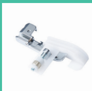
PEARLS AND SEQUINS FOOT SA217