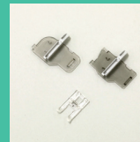
SPANISH HEMSTITCH FOOT SA220