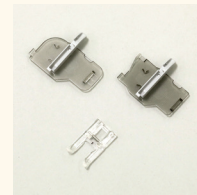
SPANISH HEMSTITCH FOOT SA220