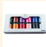
12-COLOUR EMBROIDERY THREAD SET SAETTS