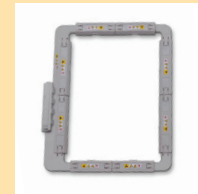
7" x 12" MAGNETIC FRAME SAMF300