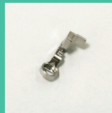
LOW SHANK RULER FOOT SA219