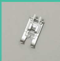
N+ MONOGRAMMING FOOT SA216