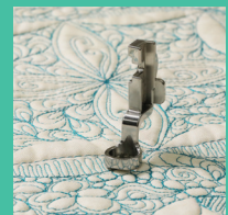
HIGH SHANK RULER FOOT SA218